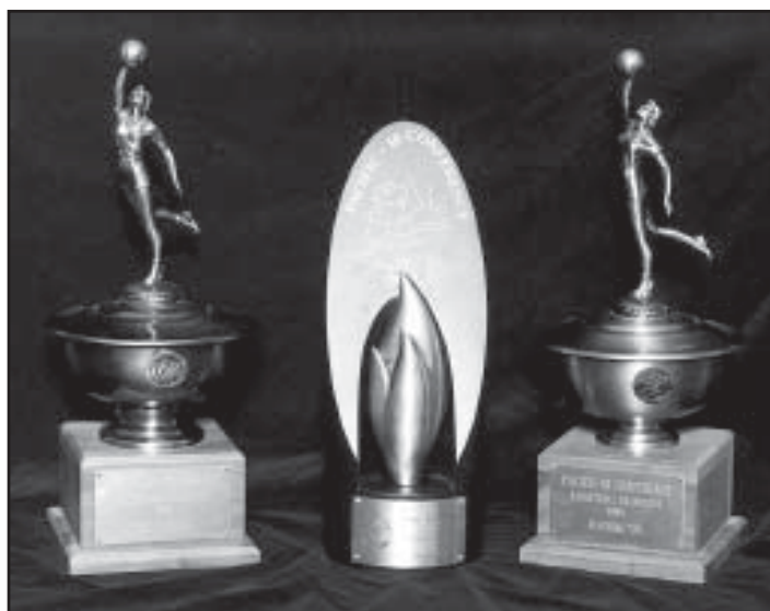
Washington has won three league championships since the Pac-10 started sponsorship of women's basketball in 1986-87. The Huskies took home the trophies for the 1987-88, 1989-90 and 2000-01 seasons.